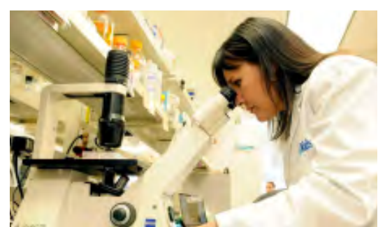
The Honourable Leona Aglukkaq